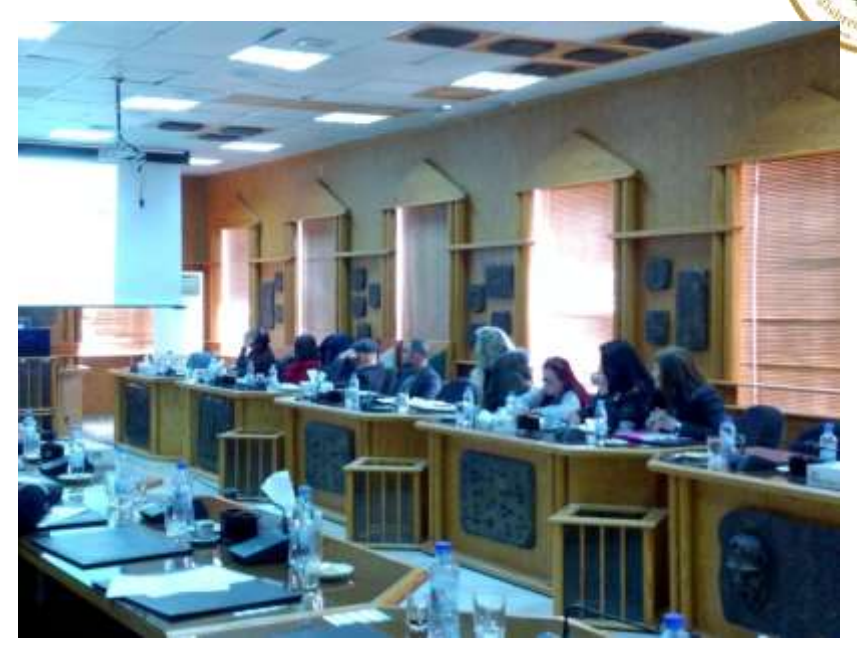
Figure 7: third Presentation