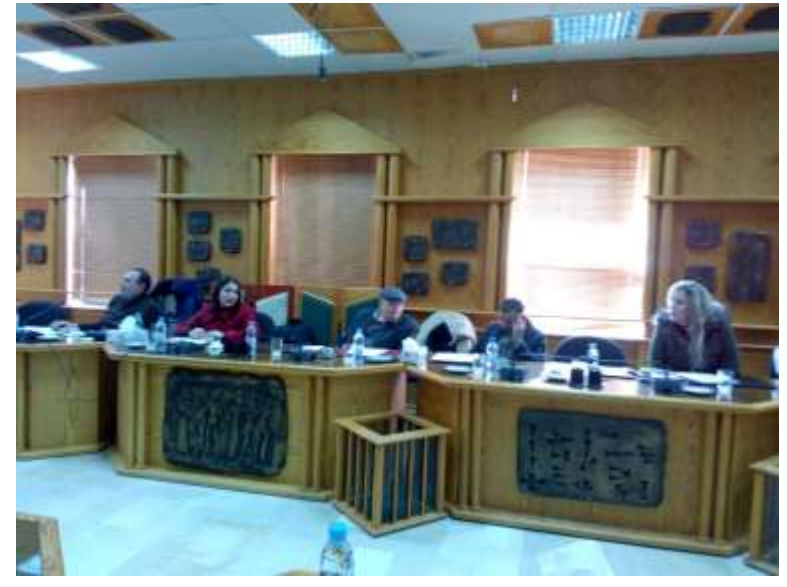
Figure 5: open discussion

b. Over view about "Environmental Engineering and Sustainable development"