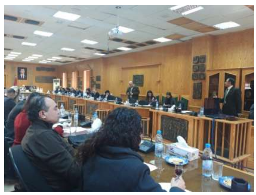
Figure 6: second Presentation

b. Over view about "Environmental Engineering and Sustainable development"