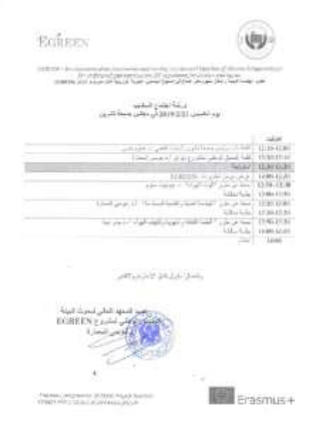
Figure 1: Agenda of the workshop

All institutions and Faculties concerned with DESIRE teaching modules were invited including, Al Manara University, Tartus University, Press office in TU, Computer Center, Civil Engineering Faculty, Mechanical and Engineering Faculty, end Economic Faculty ....etc